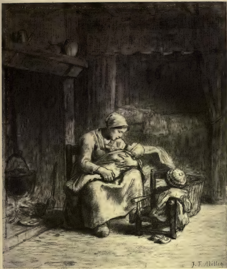
Le Retour : The Return.